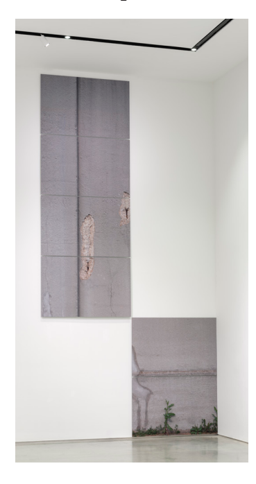
Unblinking Eyes, Awaiting, 2023 Archival pigment prints on Dibond Overall: 19 ft 6 in × 10 feet

This fragmented iteration of Unblinking Eyes , Awaiting evokes the overbearing presence of the Cook County Jail in Chicago while demonstrating the jail's fluid and versatile capacity to infiltrate countless aspects of the lives and environments within, surrounding, and beyond its walls. Gaspar deconstructs the façade of the north-end wall of the jail but maintains its scale to display the near impossibility of dismantling its impact without demolishing its structure.