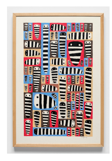
Botflies, 2022 Acrylic and ink on illustration board 32 × 22 inches

Loughney's paintings often use colorful levity to depict the absurdities of the American criminal justice system. This piece images botflies—which are a kind of parasite in the striped black and white associated with prison uniforms. This context highlights how imprisoned people are subjected to living off of a system that prospers off of them.