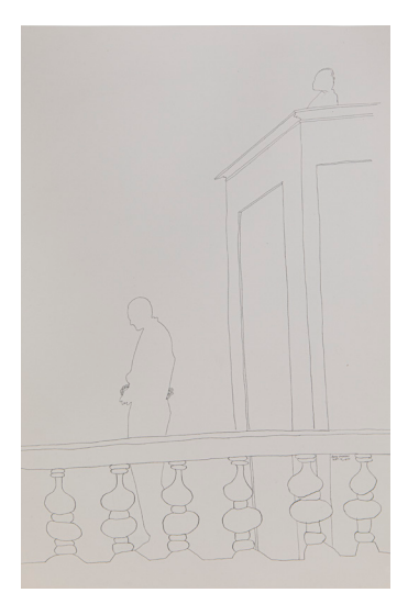
Above and Below, 1975 Pen and ink on paper 17\frac{3}{4} \times 11\frac{3}{4} inches

Depicted in these drawings and painting is the mutual nature of reform and abolition, which must stem from collaborative efforts made by those directly impacted, those in close proximity to the impacted, and those with the authority to alter the impact. Andrews' work often portrayed his commitment to confronting problems burdening Black people in the United States through interventions such as programming and protests. Poverty (Study #1-A for War), Just Thinkin', and Above and Below demonstrate the intimate condition of self-reflection in the midst of adversity.