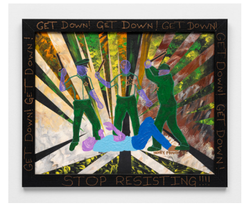
Get Down, 2022 Acrylic 18\frac{1}{2} \times 22 \times 1 inches Courtesy of the Artist

Each element of this painting is striking on its own—from a scene of policemen beating a man, to the visuals that extend out from the scene, to the exclamations that frame the scene—and yet their coalescence does not detract from their individual strength. Rather, the bold colors and designs depict the noise that instances of police brutality evoke, allowing the painting to remain as legible as the act.