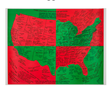
United States of Attica, 1972 Offset poster 21 <sup>3</sup>/<sub>4</sub> × 27 <sup>1</sup>/<sub>2</sub> inches

Throughout Ringgold's practice, her works have oscillated between displaying explicit accounts and subtle hints of the violent and oppressing conditions of American society towards women and Black people, mimicking their macro and micro aggressions. United States of Attica presents numerous instances of violence that have occurred throughout America's history, including massacres, riots, assassination, and wars. Both Ringgold works in this exhibition portray events of violence saturating the American landscape and acts denouncing this violence being met with further violence.