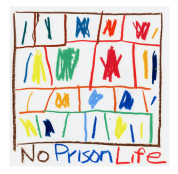
No Prison Life, 2020 Crayon on paper