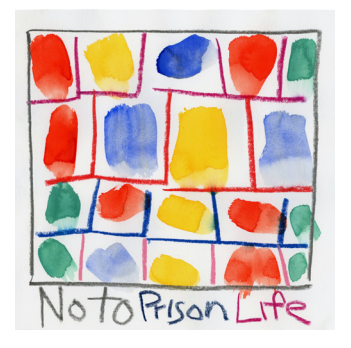
I will say it again...NO to Prison Life, 2020 Watercolor and graphite on paper

All works: 10\frac{1}{4} \times 10\frac{1}{4} inches