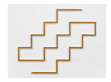
168.803, 2021 Steel, enamel, Kool-Aid, acrylic medium, epoxy resin 41 \times 49 \times \frac{1}{2} inches

Derived from the act of tracing the space between cinder blocks—a motion that is almost therapeutic in its monotony—the form of this piece follows the structure of blocks used to construct a prison cell. Roland materializes the trace of the trace to amplify a movement that reiterates space to become a formation that dominates space. 168.803 transfers the essence of confinement beyond its architectural boundaries to subvert its power.