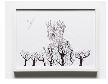
Tree of Life in Winter, 2022 Paper, pencil, string 10 × 13 1/4 inches

With Love for George Floyd, 2022 Paper, pencil, string 13 ¼ × 10 inches