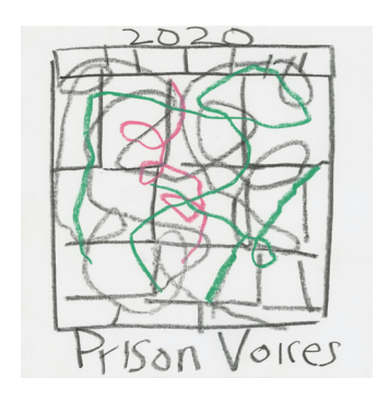
2020 Prison Voices, 2020 Crayon and graphite on paper