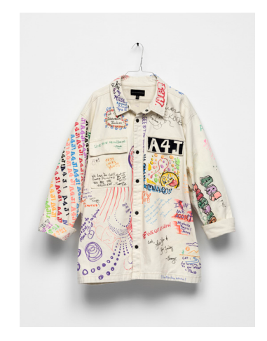
Untitled, 2023 Ink, marker, and paint on cotton canvas jacket 34\frac{1}{2} \times 30 \times 4 inches Courtesy of the Artist

This piece blends Flowers' interest in art and fashion to depict how individuals become adorned by the labels given to them and those they choose to give themselves. Flowers subverts the term "superpredator" that was harmfully attributed to Black and Brown men and youth in the 1980s and 1990s by using it in proximity to Louis Vuitton's branding as a means to complicate what politics and the media versus high fashion have designated as "in vogue" for their own personal and financial agendas.