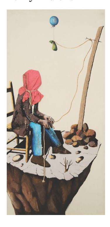
Poverty (Study #1-A for War), 1974 Oil on linen with painted fabric collage with rope 100 \times 48 inches

At the end of Benny Andrews' first art class taught at the Manhattan House of Detention, he said to the participants, "Well, that's this one, it's been great, and even more important, it's been mutual." The class, held in September 1971, marked the beginning of the Black Emergency Cultural Coalition's (BECC) art programs across the nation in prisons, detention centers, and juvenile centers, and in collaboration with people who were currently or formerly incarcerated.