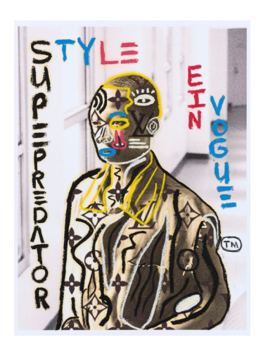
Fit For Punishment (4 of 7), 2021 Mixed media on canvas 39\frac{3}{8} \times 29\frac{1}{2} \times 1\frac{5}{8} inches