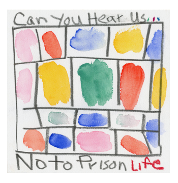
Can You Hear Us...No to Prison Life, 2020 Watercolor and graphite on paper