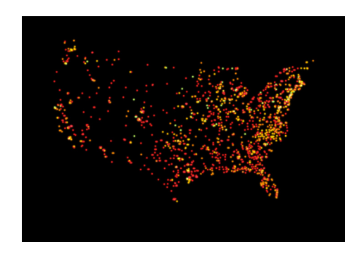
Proliferation, 2009 Video, 11:12

This piece sets original music performed by Rucker against an animation piece to map the proliferation of the United States' prison system. Each note of the composition is marked by a green, yellow, orange, or red dot, each one marking a prison built in the U.S. The green dots represent those built from 1778–1900, the yellow from 1901–1940, the orange from 1941–1980, and the red from 1981–2005. That each dot comes together over the course of the piece to form a map of the United States of America signifies how rapidly and thoroughly prisons have become embedded into the structure of America.