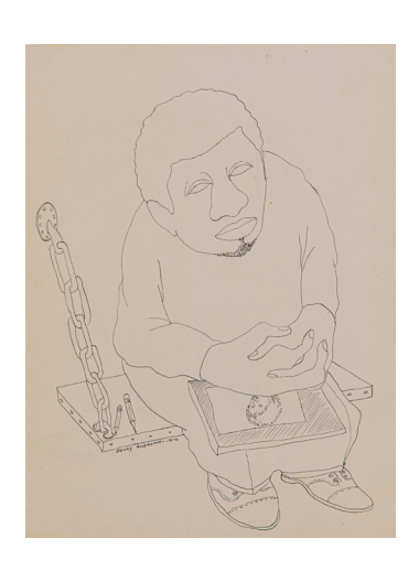
Just Thinkin', 1972 Pen and ink on paper 11\frac{5}{8} \times 9 inches