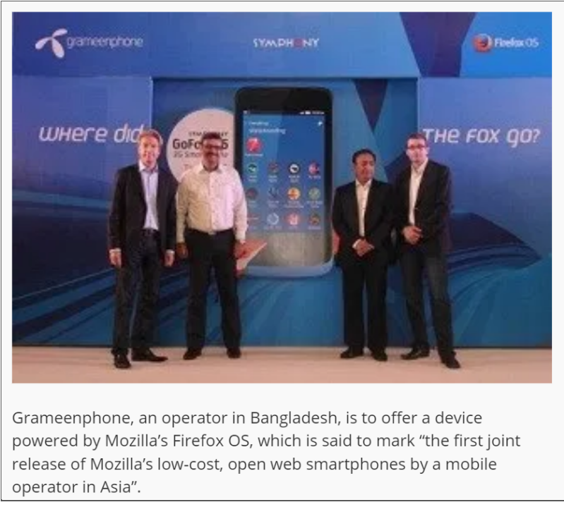
Figure 4. Screenshot from Mobile World Live news article on Firefox OS

But within a year of its release, Firefox OS was declared a failed project, as it had not gained substantial traction with user bases across the world. Reflections written by Mozilla employees have since identified various issues explaining its downfall: there was never a clear enough vision of the target market; there was a lack of enthusiasm from local partners; it was too ahead of its time; engineering and design teams were misaligned; the price was too high for the target audience.