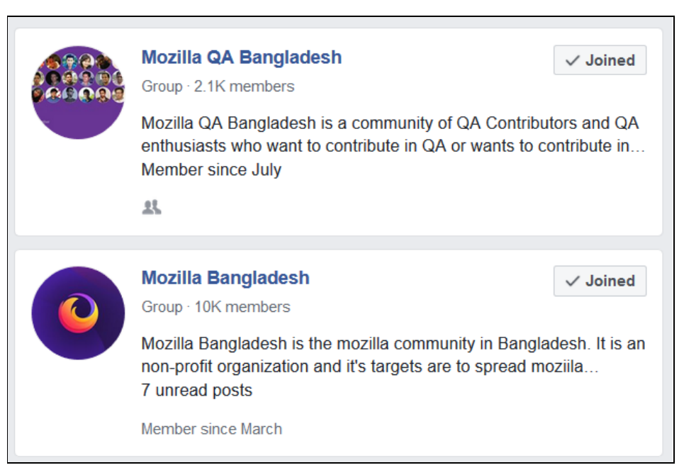
Figure 2. Screenshot of Mozilla Facebook Groups in August 2019

The following sections trace the origins of this fissure within the Mozilla Bangladesh community. Though specific details speak to the experience of a single FOSS project in a single city, Dhaka's experience with Mozilla highlights several broader tensions within a maturing, globalizing open source ecosystem. Today, uneven flows of money, disparate local ideologies, and changing leadership structures raise a set of new challenges for every open source project.