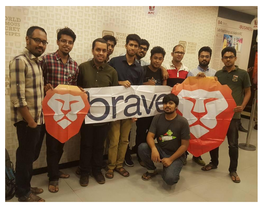
Figure 6. Group photo from browser localization meet-up

The expectations and practices for a regional community were by this point routine – every offshoot of the Computer Club or Mozilla Bangladesh community was doing similar things. Notably, localization was an activity that was required and available not only to open source projects, but also proprietary ones.