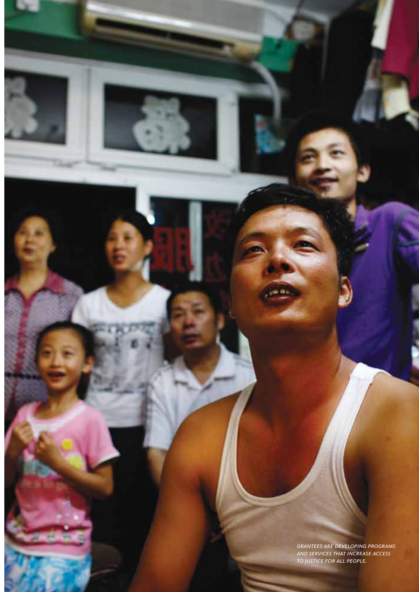
GRANTEES ARE DEVELOPING PROGRAMS AND SERVICES THAT INCREASE ACCESS TO JUSTICE FOR ALL PEOPLE.

For a full list of grantees, go to fordfoundation.org