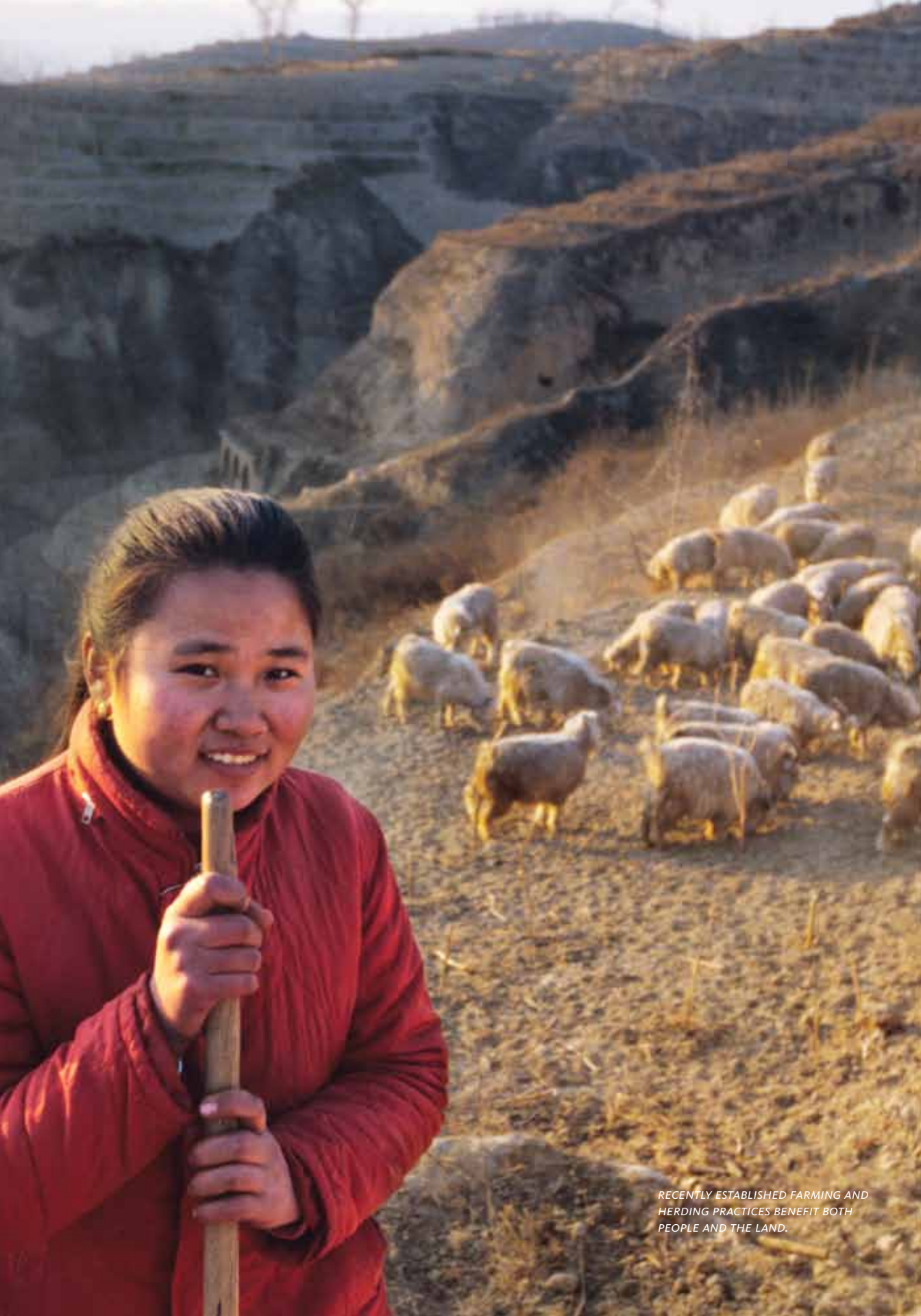
RECENTLY ESTABLISHED FARMING AND HERDING PRACTICES BENEFIT BOTH PEOPLE AND THE LAND.