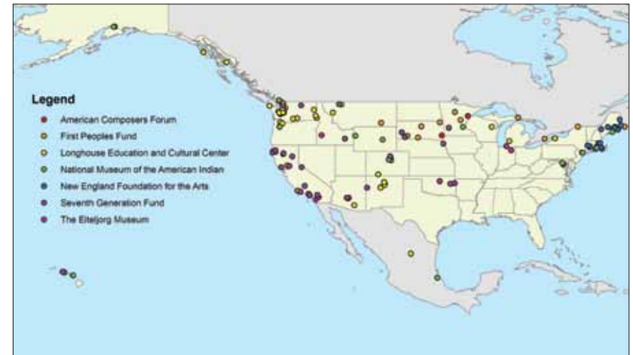
Table 1.2. Geographical Distribution of Regrantees by IllumiNation Intermediary Organization (2006–2008)