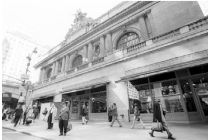
Grand Central Terminal

We now work in subcommittees organized by area of interest. Each subcommittee is learning more about neighborhood organizations in their area of interest and discussing how to best use their share of the Good Neighbor Committee budget. We are exploring how to balance support for new and existing grantees. We continue to meet as a full committee to hear recommendations and to plan activities that cut across various interests.