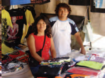
El Fondo de Inversión Social / Argentina