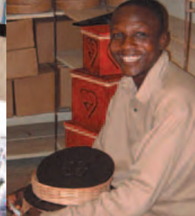
Aid To Artisans / Ghana