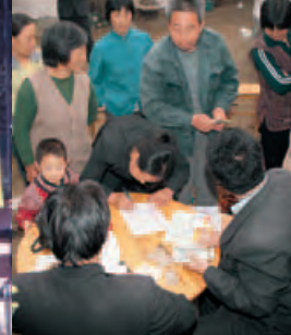
Funding the Poor Cooperative / China