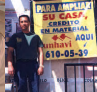
Fundación Hábitat y Vivienda / Mexico