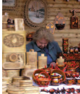
Russian Women's Microfinance Network / Russia

We support a broad range of activities, methodologies, and organizations that seek to promote economic security and reduce the vulnerability of the poor. These include