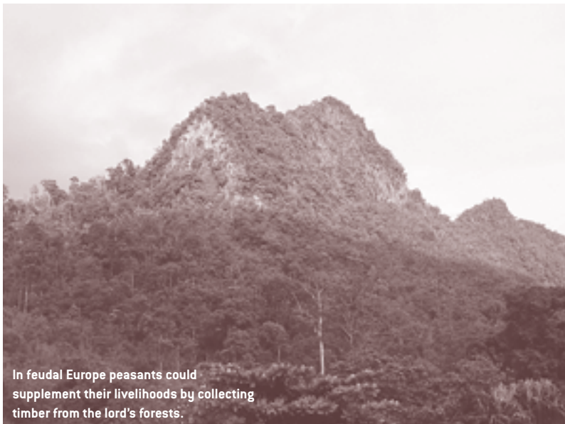
In feudal Europe peasants could supplement their livelihoods by collecting timber from the lord's forests.

The nature of the “falling apart” of the feudal system and the exact “how of it” are still debated by historians, especially when it comes to figuring out the balance of market and nonmarket forces that were brought to bear to untie people from their feudal rights and place in the world. Many scholars now focus on how tenure rights to land moved from being secure and uncontested to insecure and contested. 3 The idea was that things that were once nonmarket and not tradable (your right to be in a geographic place) became tradable in marketplaces,