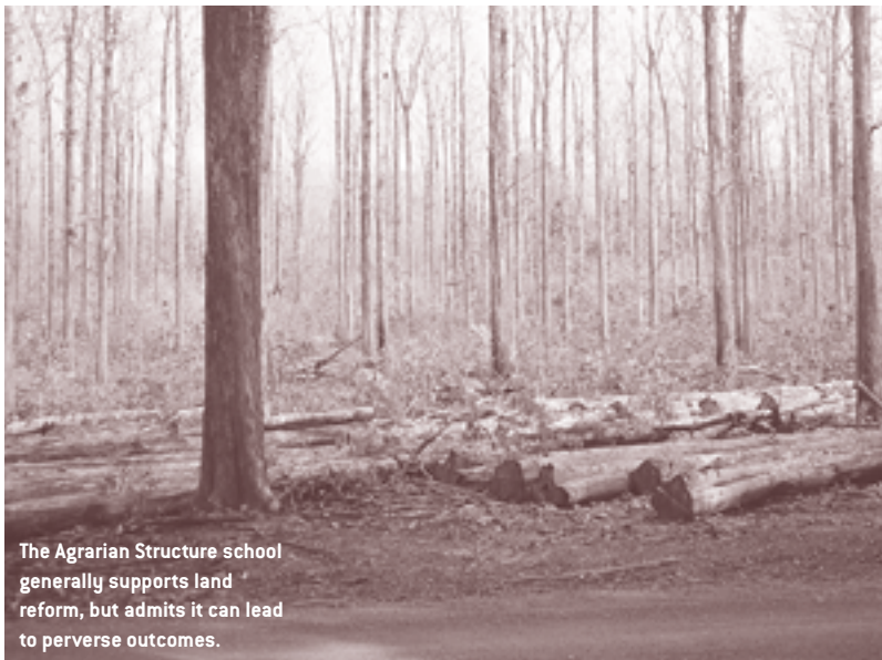
The Agrarian Structure school generally supports land reform, but admits it can lead to perverse outcomes.

value of the things inside the commons differently from the output-oriented and profit-maximizing society of the Property Rights world.