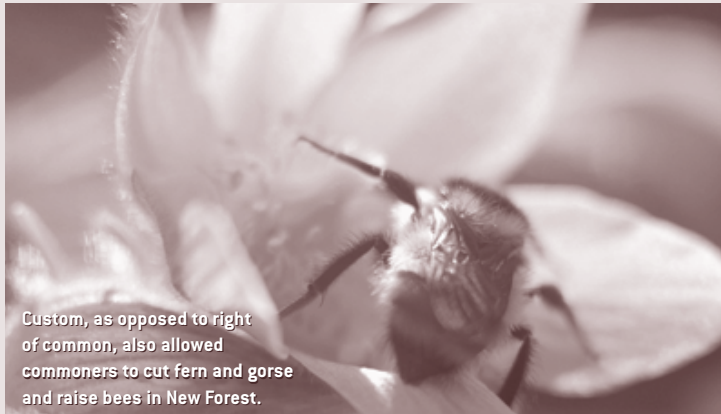
Custom, as opposed to right of common, also allowed commoners to cut fern and gorse and raise bees in New Forest.

Prior to and with the rise of the seigniorial system in the feudal era, much of Europe had vast tracts of dense forests inhabited by all manner of bark-strippers, hunters, collectors of forest products, charcoal-burners, blacksmiths, wood-ash dealers, bandits and religious hermits—all living at the margins of the community's and lord's powers. "Forest use was intense and unregulated" (Bloch, p. 8), very much like an 'open-access resource.' In fact, "the great forests of the early middle ages" were not clearly under the reign of the manorial system, being "isolated from communal life..." (Bloch, p. 8). Both lord and peasant also hunted and grazed cattle, pigs, and horses in the forests, so much so that a common unit of measurement of a forest was how many pigs it might sustain (Bloch, p. 7). From 1050 onwards, and intensifying in the late 12th to the end of the 13th century, enterprising lords throughout Europe initiated a period of large-scale forest clearances (assarts). New manors and villages were established relentlessly in what had once been forest and marsh. Forests soon came to be islands in a sea of agrarian land use. Many villages opposed forest clearances – "accustomed as they were to benefit from the grazing or the free enjoyment of the forest's wealth. So it was often necessary to sue them [the